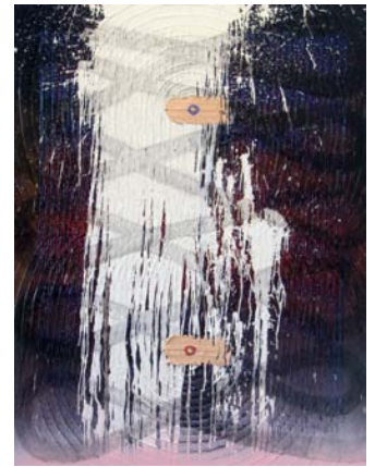
Christine Frerichs The Conversation (#5) 2012 oil, acrylic and spray paint on canvas 44 by 34 inches

gallery km is proud to present The Conversation , our first solo show of work by Los Angeles-based artist Christine Frerichs. The exhibition is presented in two distinct but related series in the west and east galleries, one featuring a series of ten sequentially grouped mid-sized mixed-media paintings on canvas, and the second featuring one large and several small paired canvases. The exhibition will take place from June 15 through July 27, 2013, with an opening reception for the artist on Saturday, June 15 th , from 6-8pm.