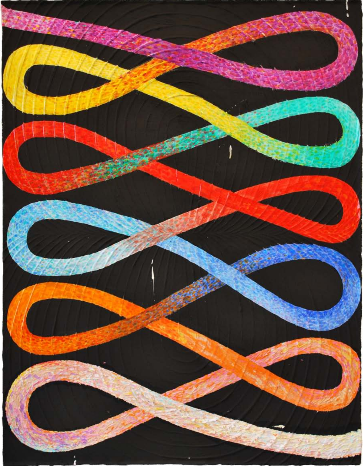
Christine Frerichs The Conversation (#1) 2012 oil, acrylic and ACP on canvas 44 by 34 inches