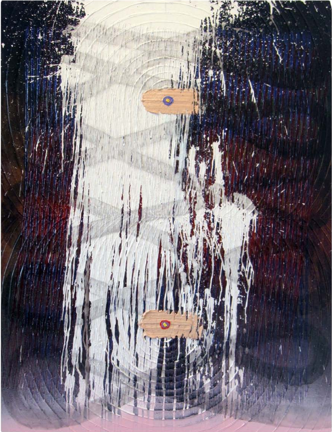
Christine Frerichs The Conversation (#5) 2012 oil, acrylic and spray paint on canvas 44 by 34 inches